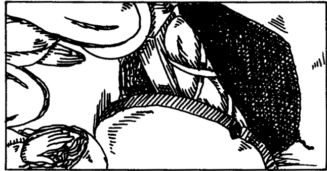
14. Jesus is laid in the tomb.