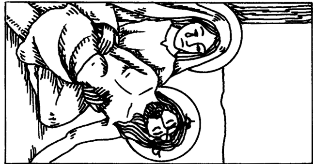
13. Jesus is taken down from the cross.