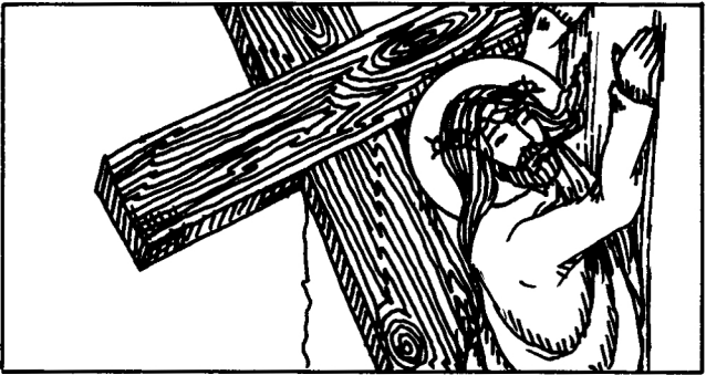
9. Jesus falls the third time.