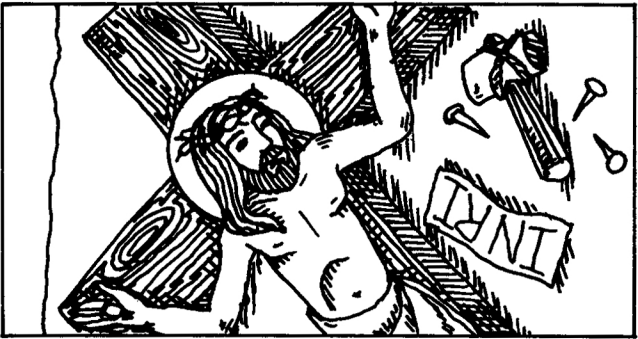
11. Jesus is nailed to the cross.