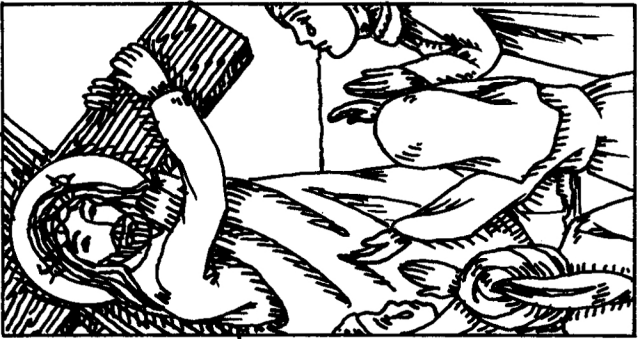
8. Jesus meets the woman of Jerusalem.